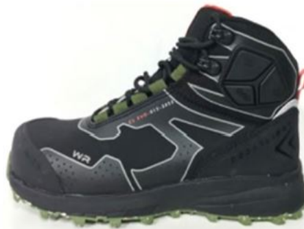
NORTH S7L(article code:6362)