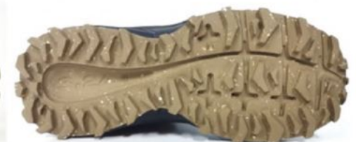
TERRA S7L(article code:6382)