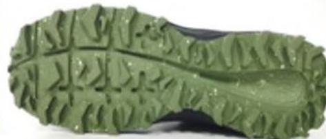
NORTH S7L(article code:6362)