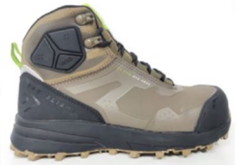
TERRA S7L(article code:6382)